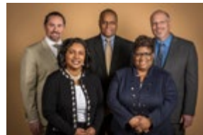
Cheers from the Shared Leadership Team

We hope you enjoy this issue of the RHA Times and wish all of you a happy, healthy New Year filled with many blessings.