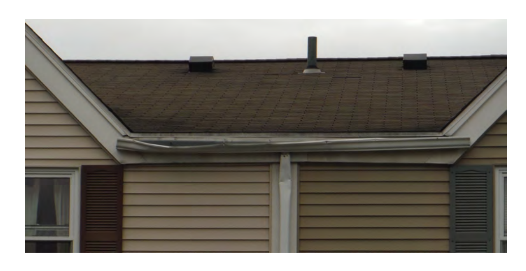
Before replacement, some gutters were damaged.

This family complex is located in the north eastern part of Rochester, nestled between a couple of secluded streets. Ten buildings include 16 two-bedroom, 16 three-bedroom, 10 four-bedroom, and 2 five-bedroom units. The roofs were replaced as part of the Rochester Housing Authority's Capital Improvement program.