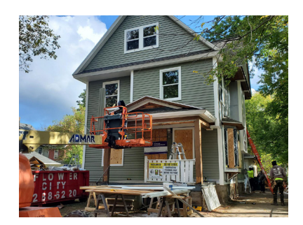
Denver Street New siding installed at Denver Street.