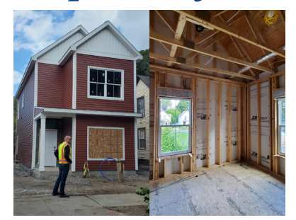
Melville Street Melville Street is a complete tear down/rebuild of an approximately 700-square-foot house with three bedrooms.