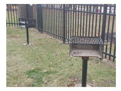
University Tower Outdoor grills were installed, as residents requested.

321 Lake Tower A new floor was installed in the community room. Flooring in the offices and kitchen, off the community room, will also be replaced to match, as residents have requested.