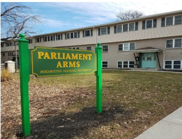
Doors replacement at Parliament Arms, including the building entry door, office door, garage door, secondary doors facing the courtyard, and rear door.