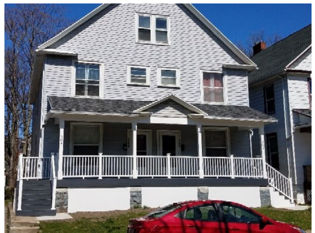
Porch replacements at 51-51 1/2 Woodward Street, 8 Lochner Place, 78 Shelter Street, 217-223 Troup Street, 382-384 Hawley Street, and 185-187 Berlin Street.