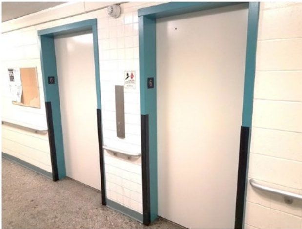
Upgrading elevators at five high rise locations within Danforth Tower West.

At RHA, our team is constantly working to improve the quality of life for all our residents. We are excited to announce the completion of the following projects: