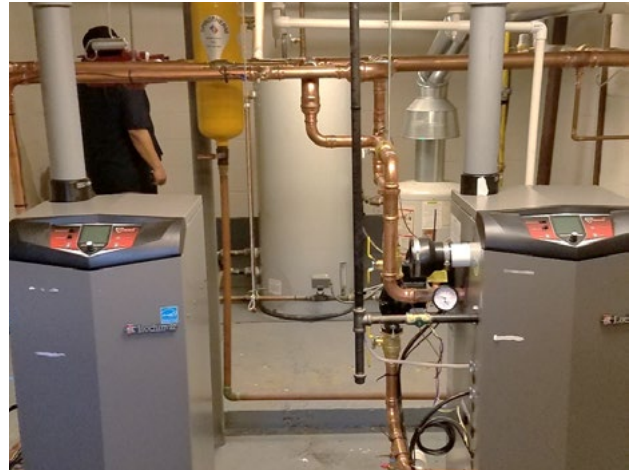
Replacement of new high-efficiency heating boilers at Lexington Court.